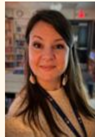
Sarah Rogers Communications