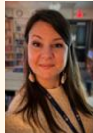
Sarah Rogers Communications