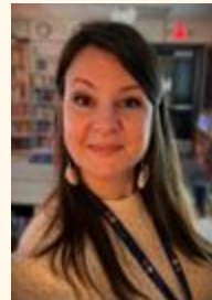
Sarah Rogers Communications