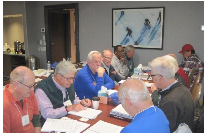
Working on a scenario at AKT. I am third from the wall, facing the camera.

AKT was great, even though it was overwhelming. Lots of information in just a few days. The class included working on several scenarios. This was great, giving us practice finding and working with the Kairos manual to answer questions we will face as we prepare for a Kairos weekend. We shared our results with the other groups, and they shared theirs with my group. I want to take some time to go over everything before I need to train the team for our first Kairos weekend in Koboko.