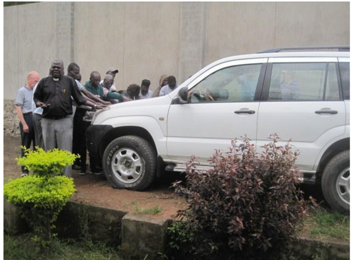
The blessing of the mission vehicle—Land Cruiser Prado

We (the mechanic, myself, and the prison ministry team) thought everything was repaired. Satan was not happy. The cam-shaft broke on the way to ministry at Lobule prison. The mechanic came out to the vehicle and spent the next several days taking apart, inspecting, repairing and rebuilding the engine. Now we have successfully used it for prison ministry for a month. IF that was not blessing enough, during the same month two prisoners at Lobule and six at Gbukutu (Koboko main) prison gave their life to Christ during the ministry visits.