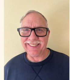
Dave Peterson Building and Grounds