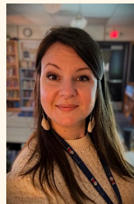
Sarah Rogers Communications