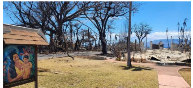
Holy Innocents Episcopal Church