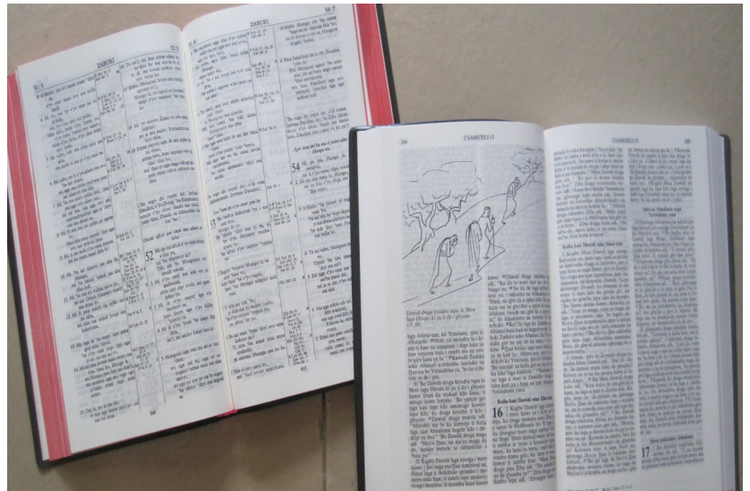
Local language bibles: Lugbara (on left) and Kakwa.

Recently we were asked if we could provide a bible in the Lugbara language. Yes we can. We have provided two in the past, but we did not mention that. We sent the Lugbara bible with the team members selected to minister the next week. (We are limited in how many team members we can send per week.) The following day I received a message from the Deputy OC (Officer in Charge) saying that the prisoners rejected the bible because it is not a Catholic bible. I responded that when I went to buy the bible, I was told there is only one translation of the bible in Lugbara and only one translation in Kakwa. I have since asked others, who have said the same thing.