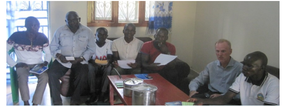
Prison ministry team preparing Bible study material for sharing in the prison.

We returned to the prison for ministry in August 2022. We resumed ministry in faith that God would use us to deliver his message, and that his message would be received. Attendance by the prisoners reached numbers previously unimagined by me, 32% of the prison population. A friend who, years ago, spent four days in prison told me how important it is to the prisoners that a ministry team visits them faithfully. We endeavor to do that.