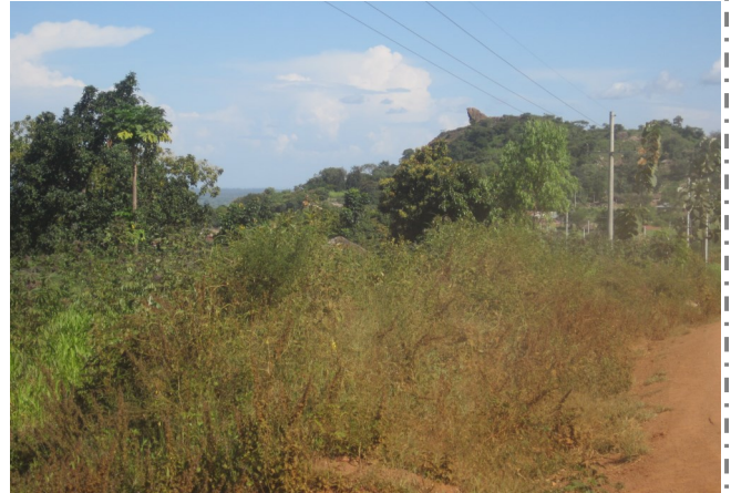
The countryside around Lobule. The rock on top of the hill looks down on the prison (behind the trees).

Lobule (phonetically: low-boo-lay) is a small community in the valley running in front of a string of hills approximately 7 to 10 kilometers east of Koboko municipality, in the district of the same name. It is home to the second of two prisons in Koboko district. Because Uganda does not allow pictures of government structures I thought I would offer a picture of the hill on the other side of the road from Lobule prison. Here these hills are thought of as mountains. It gives me an understanding why mount Tabor is referred to as a mountain in the Bible. It is big when compared to anything within sight; however, it is small from the perspective of someone who grew up in the Pacific Northwest between the Olympic and Cascade mountain ranges. Here the mountains rise 200 to 300 meters above the surrounding landscape (600-900 feet). In the Pacific Northwest the surrounding land starts at sea-level (0 feet) and the passes/gaps between the mountains, are above 3,000 feet and the mountains go still higher.