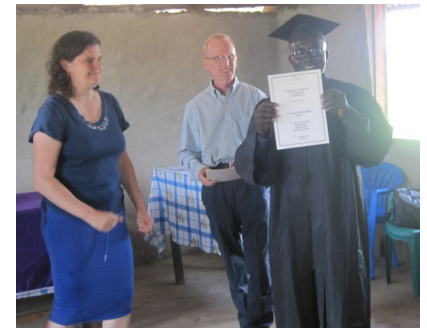
Archbishop Hakim Joseph