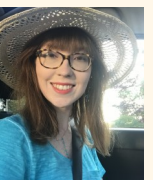
Chelsea Reeder Communications