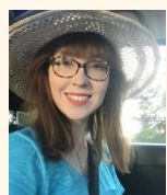
Chelsea Reeder Communications