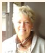
Tovi Andrews Hospitality