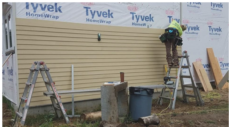
Siding installation at St. Antony of Egypt Episcopal Church. (Yes, it will be painted a different color.)