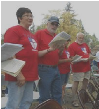
Singing and Praising!