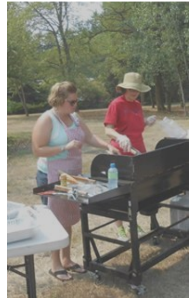
Two amazing chefs!