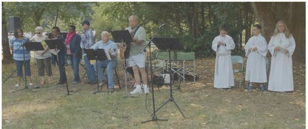
Our music makers and Acolytes.