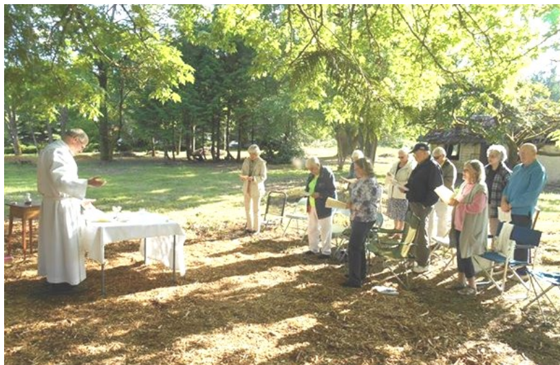
Ascension Day service on our new property. May 14, 2015